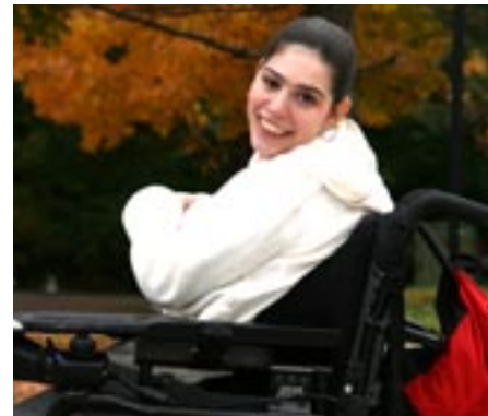
Chart your own course—the first step is going through OPWDD's Front Door!

Now that you know more about what we have to offer, the next question to think about is where you want your life to take you, and how OPWDD can help.